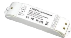
RGBCW DALI CONTROLLER